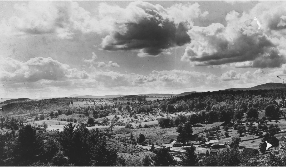
One of the views the Strongs would have enjoyed looking west– Kings Highway