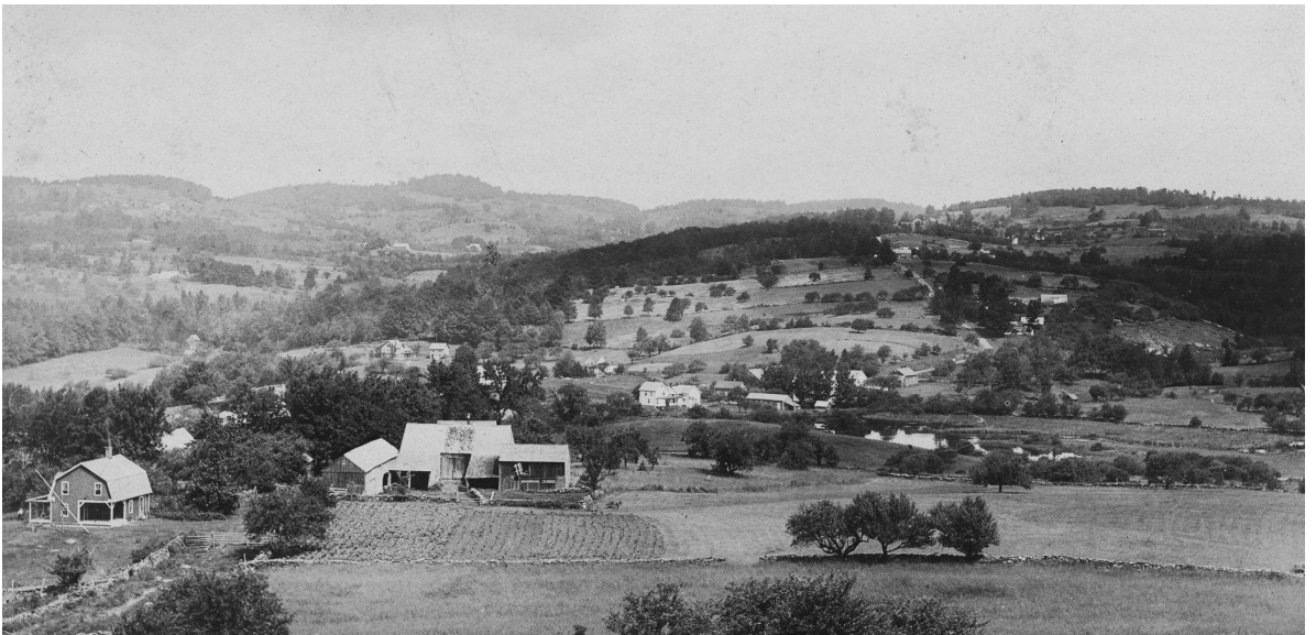
Another view from the same area on Kings Highway