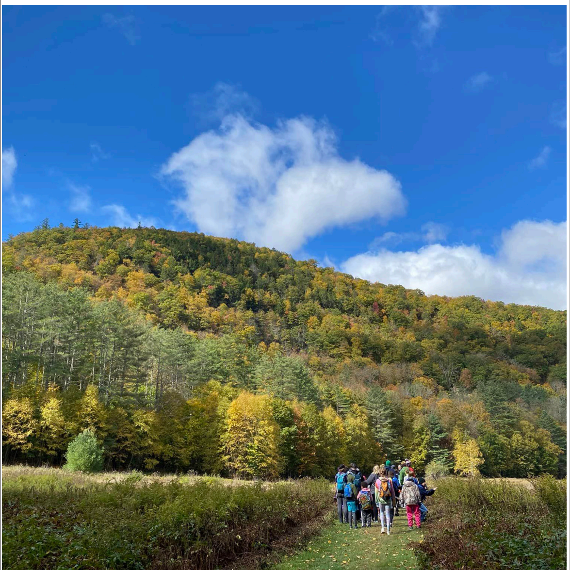
All school hike